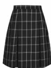
Box Pleat Skirt