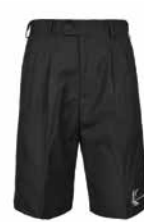
Pleated Front Shorts