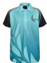
Sublimated Polo Shirt