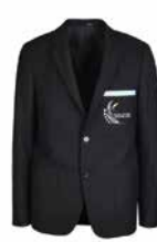
Twill Blazer with Chest Pocket