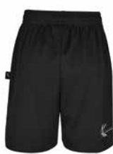
Mesh Sport Shorts