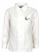
L/S Jacquard Blouse