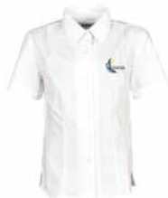
S/S Jacquard Blouse