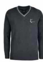
Wool Blend Jumper