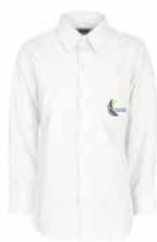
L/S Shirt - Stand Collar