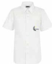
S/S Hip Shirt